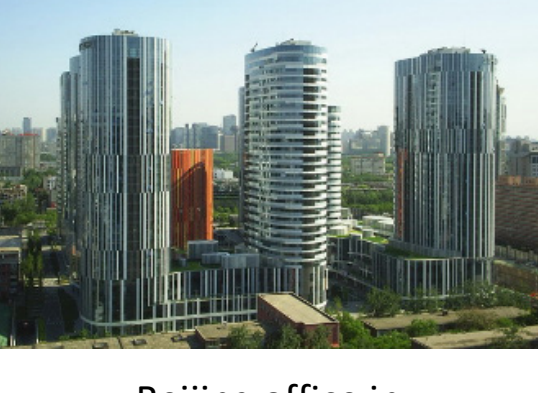
Beijing office in Sanlitun SOHO